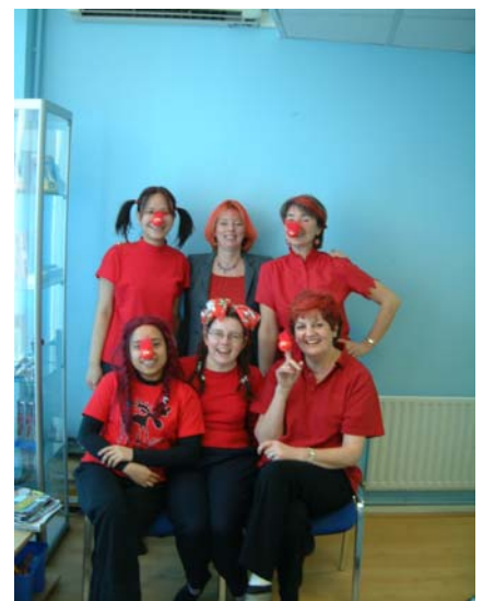
The Dorking Practice, in Comic Relief mood, raised £100

As you are no doubt aware, there have recently been discussions within the industry with regard to the future of dentistry. Some of the key issues are due to be introduced from April 2005 and as such, ADP is keeping abreast of these developments. The key points will be addressed in a future issue of the newsletter, but the main factors currently surround Options for Change and PCT Contracts and dental relationships. It is interesting to note a leading member of our profession has commented “ ADP will be ideally placed to do business with the new PCT management and will do very well ”.