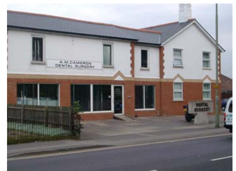
The Kidlington Surgery

cal stress practice. The staff assure absolutely everyone, wholeheartedly, that they are very hardworking". Who are we to doubt them?!