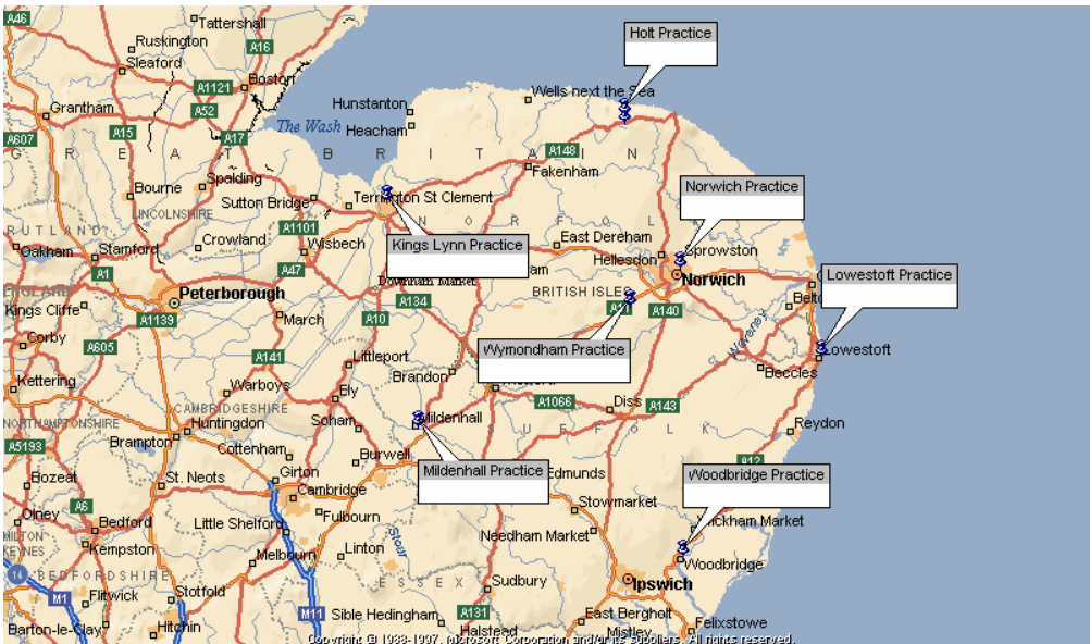
The Existing Healy Dental Group Practices